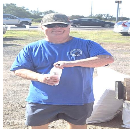
June HH @ The Reserve on 1863